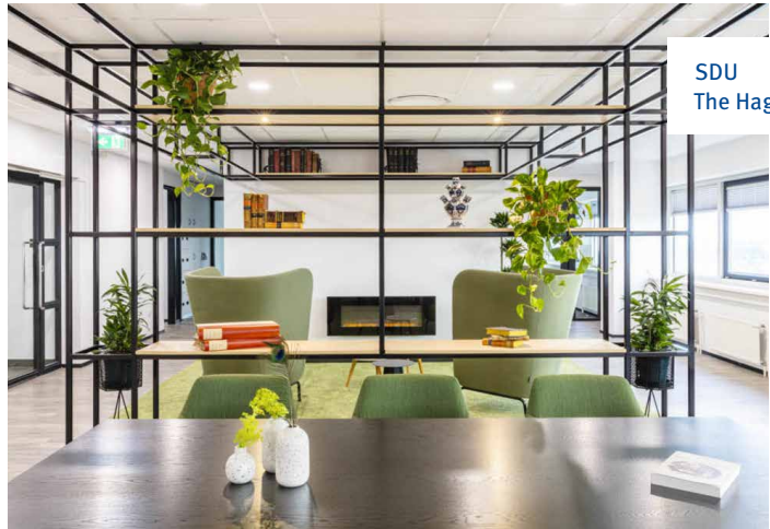
SDU The Hague

In 2019, Sdu moved its office to this visible location on the Maanweg along the A12 highway. After working with Drees & Sommer in an earlier project, Sdu appointed the Project Management and consulting company to supervise their relocation process. As client representative, Drees & Sommer supervised quality, planning and budget during the renovation and fit-out of the new office.