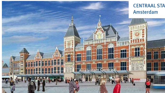
CENTRAAL STATION AMSTERDAM Amsterdam

Client: Stebru Vastgoed Business line: Project Management/Construction Management