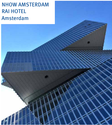
NHOW AMSTERDAM RAI HOTEL Amsterdam

With 650 rooms on 25 floors, the nhow Amsterdam RAI hotel is the largest newly built hotel in the Benelux countries. The most eye-catching feature is not just the sheer size of the hotel, but also the design, provided by OMA architectural studio, and the three stacked triangles required a very special construction. The four-star hotel is situated directly next to the RAI complex. The project developers COD and Being Development commissioned BOAG to monitor progress, quality and safe execution of the project.