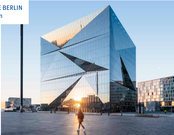
CUBE BERLIN Berlin

With the support of Drees & Sommer, cube berlin – an office building as smart as it is spectacular – was completed in a construction period of just over three years. Built by CA Immo, cube berlin is in a prime location on Washington Platz, a square next to Berlin Central Station. Designed by 3XN Architects, the cube-shaped building is a unique combination of technology, architecture and sustainability. A holistic digitization strategy was developed and implemented in collaboration with the client, making cube berlin a flagship project that lays claim to being the smartest building in Europe.