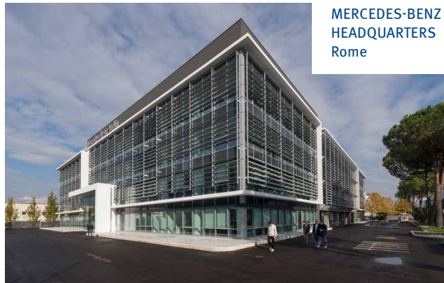
MERCEDES-BENZ HEADQUARTERS Rome

Client: BBC Worldwide & BBC Commercial Holdings Business line: Facility Management Consulting/ Project Management